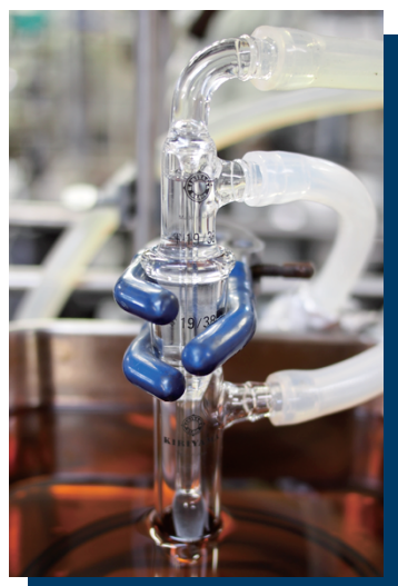
Example of experiment