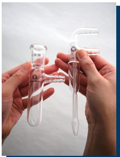
Compact condensing unit and sample tube

By combining the joint portion and the center condensing pipe, it is very simple and easy to wash and the endurance is enhanced.