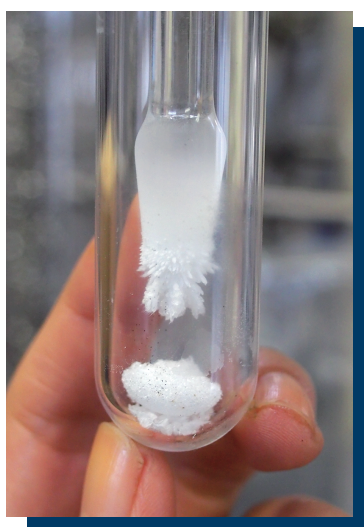
Purification by sublimation (crystal like needle)