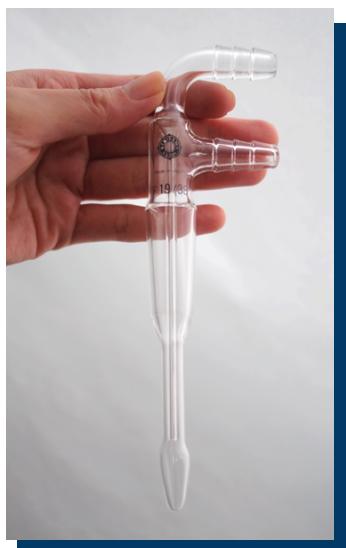
Condensing unit with no dead space